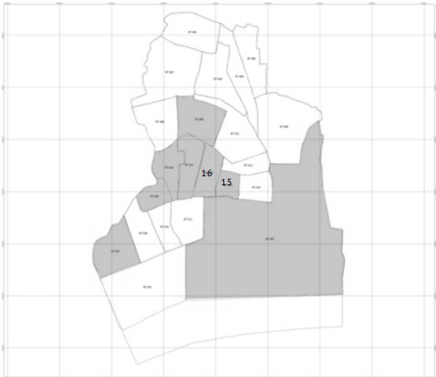
Figure 1. Map of Lawang Kidul Village.

The weight and volume of MSW are recorded, so the generation and density of MSW were measured based on the dimensions and volume of the MSW container. Then, waste composition was expressed as a percentage of wet weight. The sorting of MSW was carried out based on the types of MSW that have been determined (food waste, paper/cardboard, wood, cloth/textile products, rubber/leather, plastic, metal, glass, etc.) in every waste container. Sorted MSW is weighed and recorded according to the type of waste. The MSW fraction (% of wet weight) for each components was calculated by dividing the total wet weight of each MSW component with total weight of MSW [21].